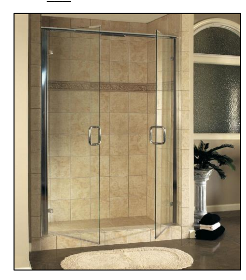
Framed & Semi-Frameless Shower Glass thickness options: