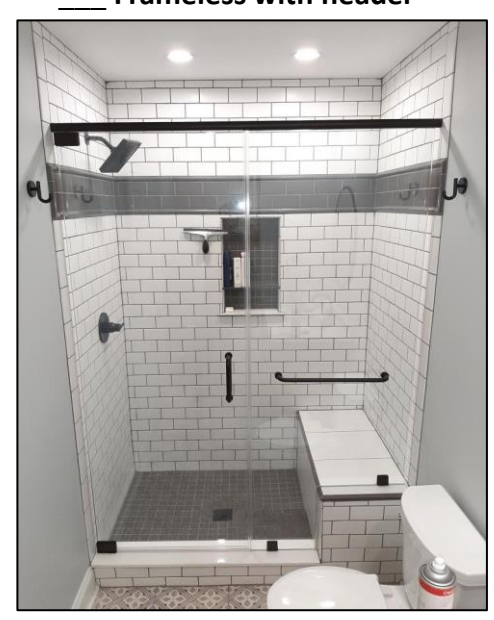
Frameless shower glass thickness options: ____ 1/ 2" ____ 3/8"