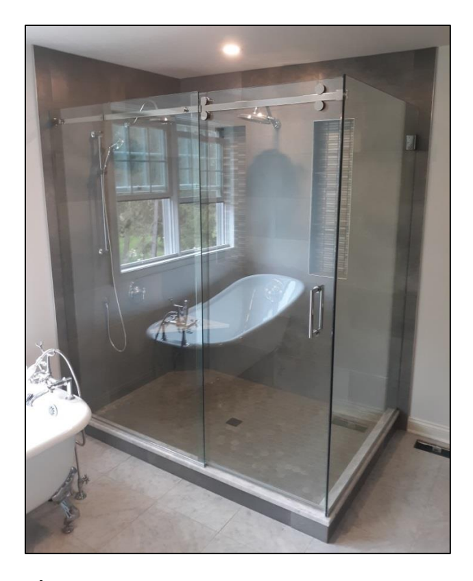
____Serenity (the hardware is what makes it a different type of slider)