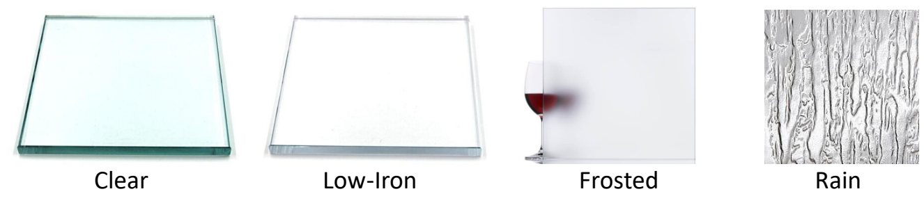
Step 3. Pick Your Glass Style

For 3/8" & 1/2" limited colors and pattern available.